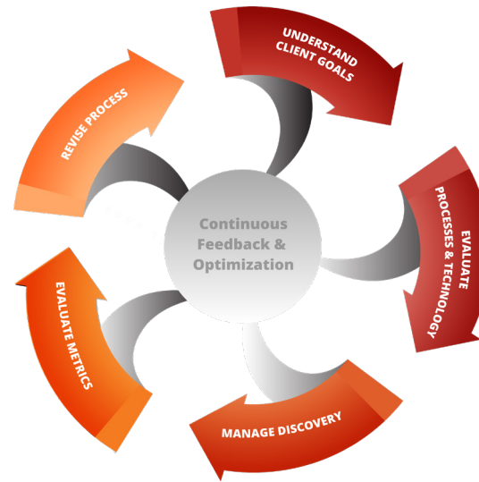
Diagram 1. Client Feedback & Optimization

Legal departments are accountable for costs, and managing costs requires analyzing metrics. Clients utilizing multiple outside counsel often have little insight into expenses across matters or ways to create more efficiency. That's where we come in – ESI Attorneys uses data to understand where processes can be improved, and resources can be leveraged for a more effective outcome. We'll be happy to discuss the standard metrics we capture for clients as well as some unique data points that have allowed clients to recognize substantial cost savings.